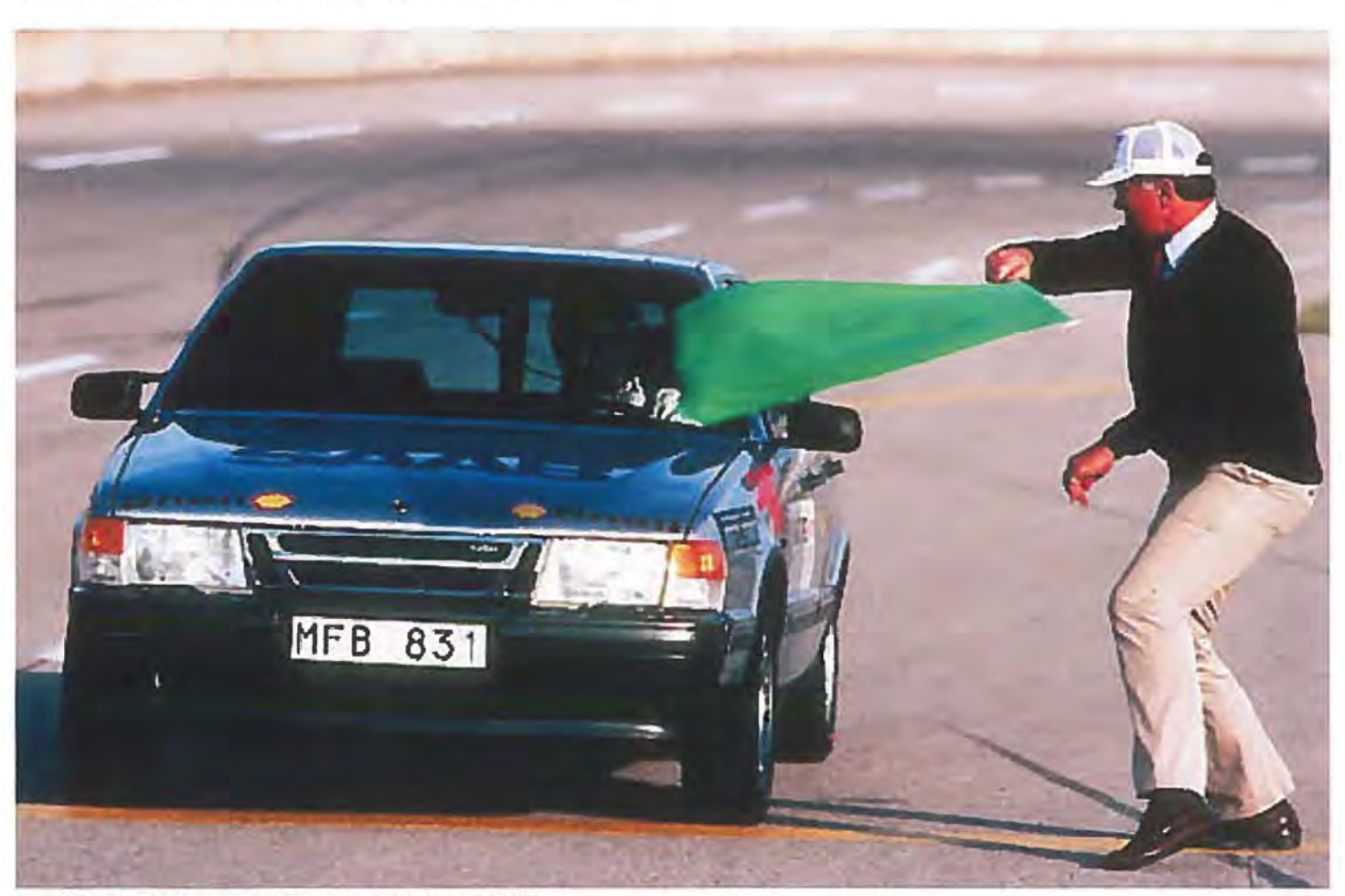
Start of The Long Run at 8 AM, October 7, 1986.

Look for the concluding part 3 in the next issue of NINES!