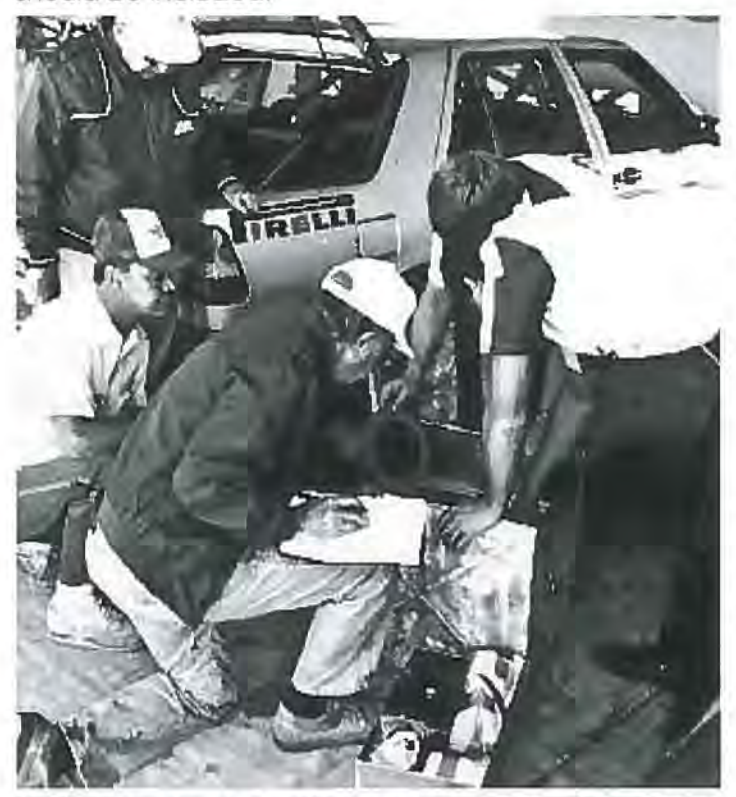
NASCAR representative checking that spare parts were in accordance with each vehicles list of spares.

The choice of spare parts was therefore given careful consideration. The main criterion for selection was that only components that couldn't be repaired should be included.