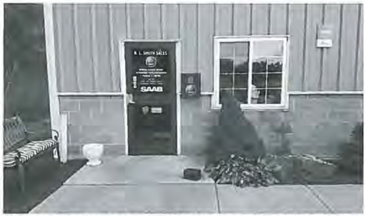
A view of the front of the main service building.