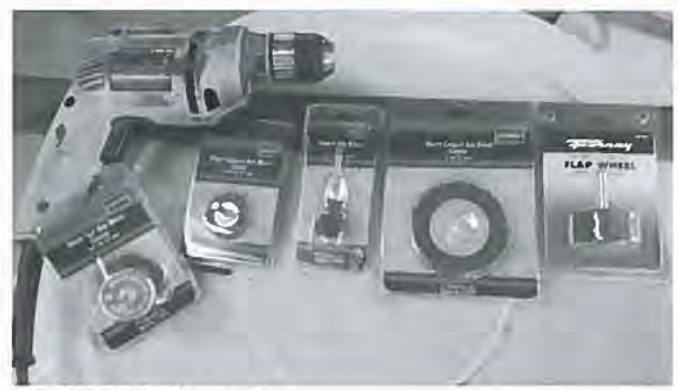
The repair implements.

to allow the product to reach the tight areas. This product is very thin and will penetrate well but it definitely makes a mess so use it sparingly. You can always apply again if you don't think the coverage was adequate.