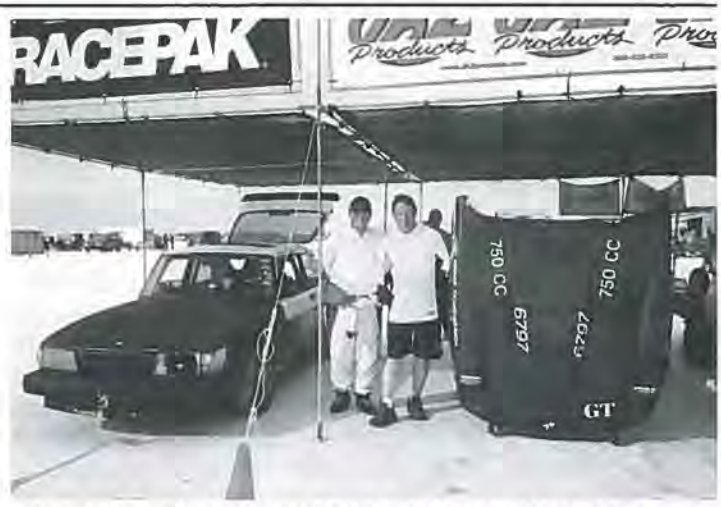
Both cars after being certified in tech inspection for new records.

If you look at the record book of all the different records you'll see that we are running faster than almost any "J" engine (501-750cc) has EVER ran in a non-blown, non-altered, GAS category. Also we are consistently running faster than many of the "I" engine (751-1000cc) which are 250cc higher! (We actually have a higher record than the I class above us currently in the GT category!)