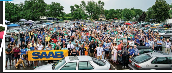
Order prints of the group photo at SaabClub.com

This year, we had a record turnout in Albany, with over 350 vehicles and well over 600 people in attendance. We would like to thank the many club members who submitted photos and allowed us to use them in this special issue of 9s printed to celebrate SOC 2021. Throughout these pages, enjoy seeing the beautiful vehicles that earned recognition while also seeing a few of the amazing people who make the Saab community unique and enduring.