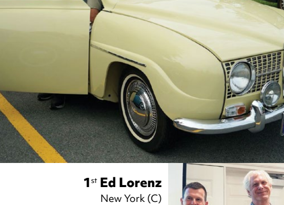
New York (C