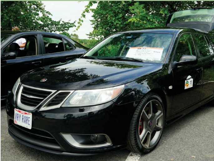
1 st Sanjay Patel Ohio (R)